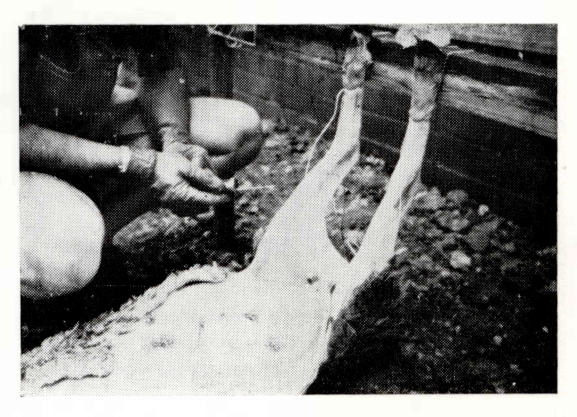
Illust, 1.—Sheep anaesthetised and secured in dorsal recumbrancy being infected with cercariae.

On 3rd December, 1968, Blair Research Laboratory exposed 39 Bulinus (Physopsis) globosus to miricidia hatched from eggs obtained from bovine bladders.