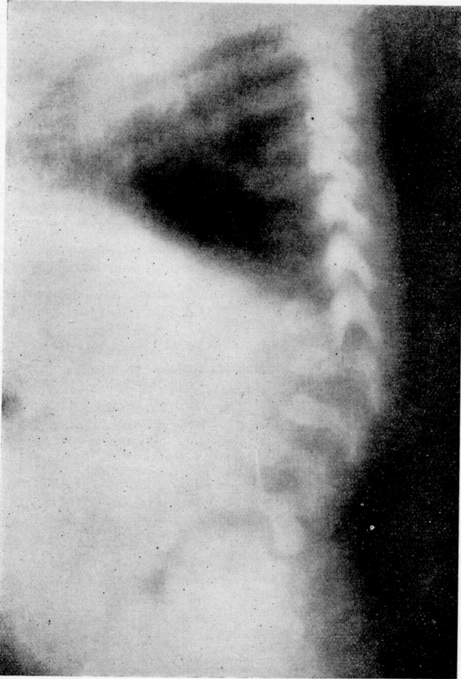
An X-ray demonstrating the dorso-lumbar kyphosis. The vertebrae are biconvex, the anterior part being nothing but inferiorly projecting hook-like processes.

to be a lipid substance, but evidence 5 suggests that this is not the case and some have postulated a muco-polysaccharide. These abnormal deposits occur in bone, reticulo-endothelial cells such as liver and spleen, anterior lobe of the pituitary and corneae.